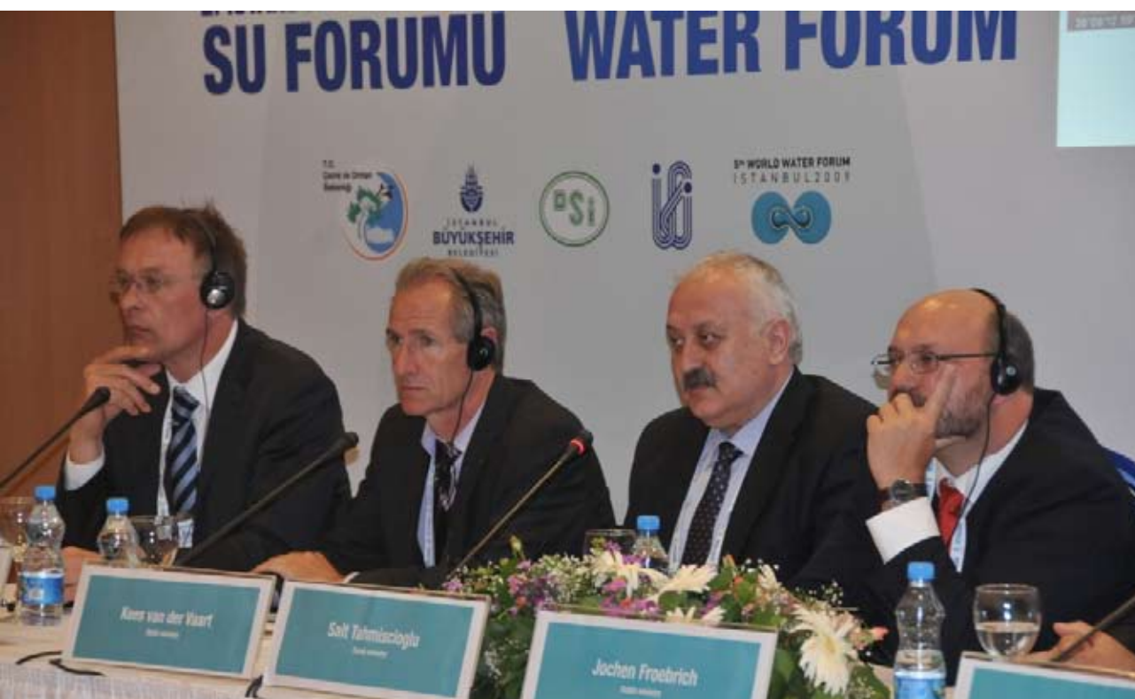
Panellists of the side event “Turkish - Dutch Cooperation on Water, Agriculture and Innovation”

Dutch and Turkish specialists proposed solutions for problems in water allocation, sustainable water management and wastewater treatment and discussed opportunities for innovation in agriculture and land consolidation. Specialists treated social and financial aspects of water management and introduced the joint projects of Dutch Government Agency for Land and Water Management (DLG) with Turkish Ministry of Agriculture and Rural Affairs and Ministry of Environment and Forestry.