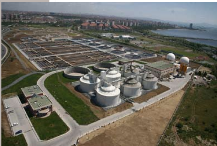
Ataköy Advanced Biological Wastewater Treatment Plant

The cultural trip consisted of visits to the historical water structures around Istanbul that trace back from Roman and Ottoman times and many of which can still be used today.