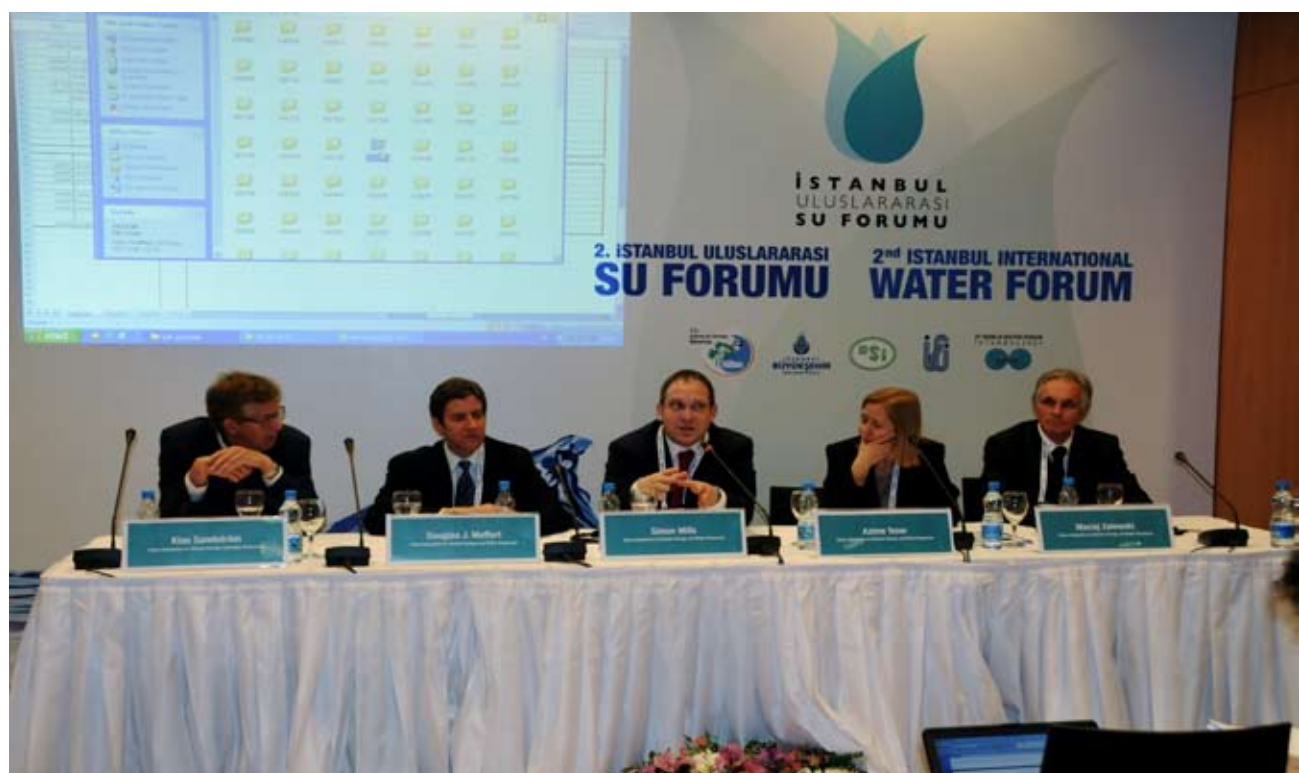
Participants of Session 4.3. Urban Adaptation to Climate Change and Water Resources