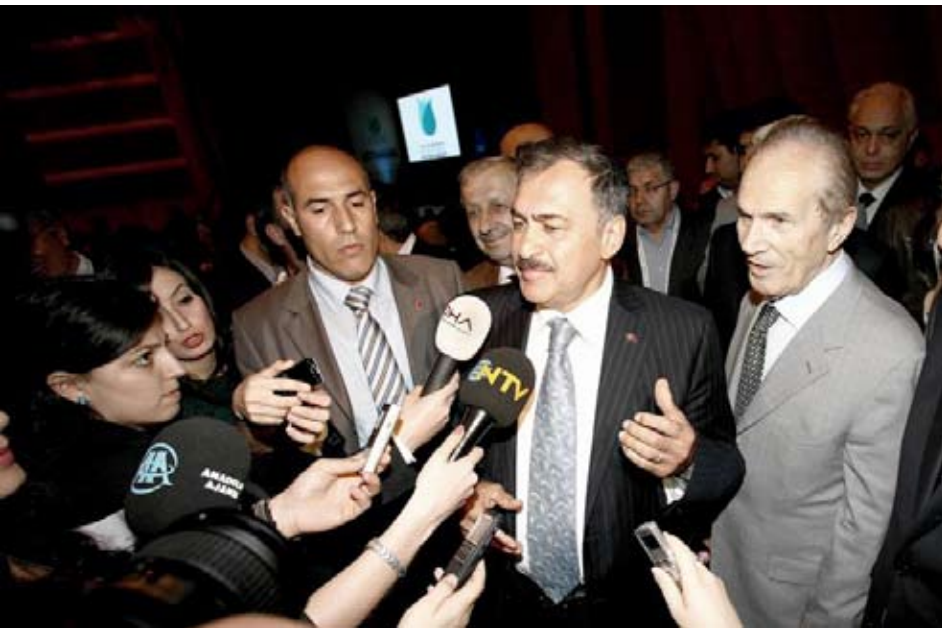
Prof. Veysel EROĞLU, Minister of Forestry and Water Works of Turkey, talking to the press after the Opening Ceremony

of the International Office for Water gave exclusive interviews. The 2 nd Istanbul International Water Forum also featured in the “Gelecek Gündemde” (Future Agenda) programme on CNNTurk - a series of films highlighting solutions to some of the key global challenges for 2020.