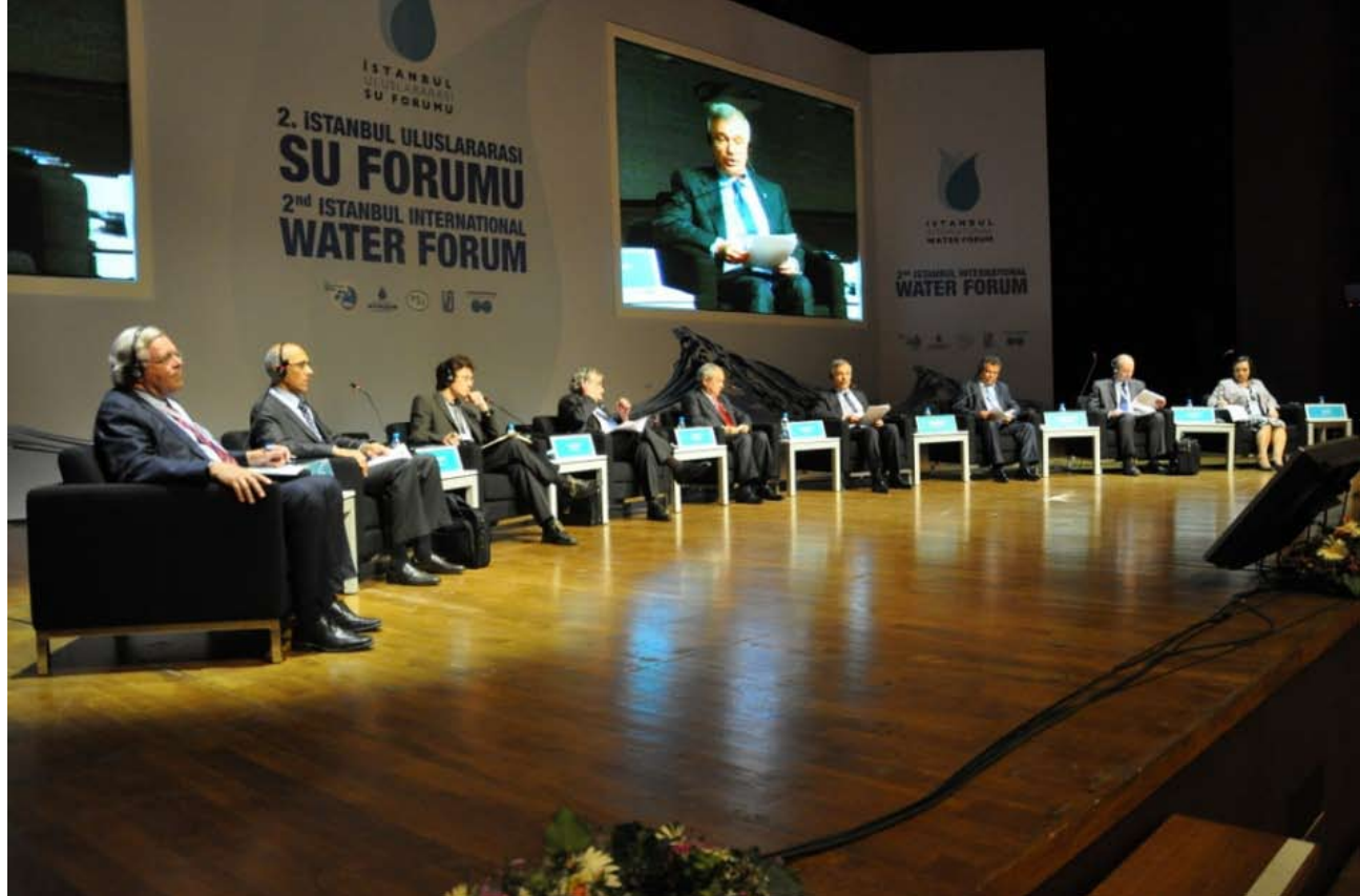
High Level Panel on Water-Food-Energy Nexus