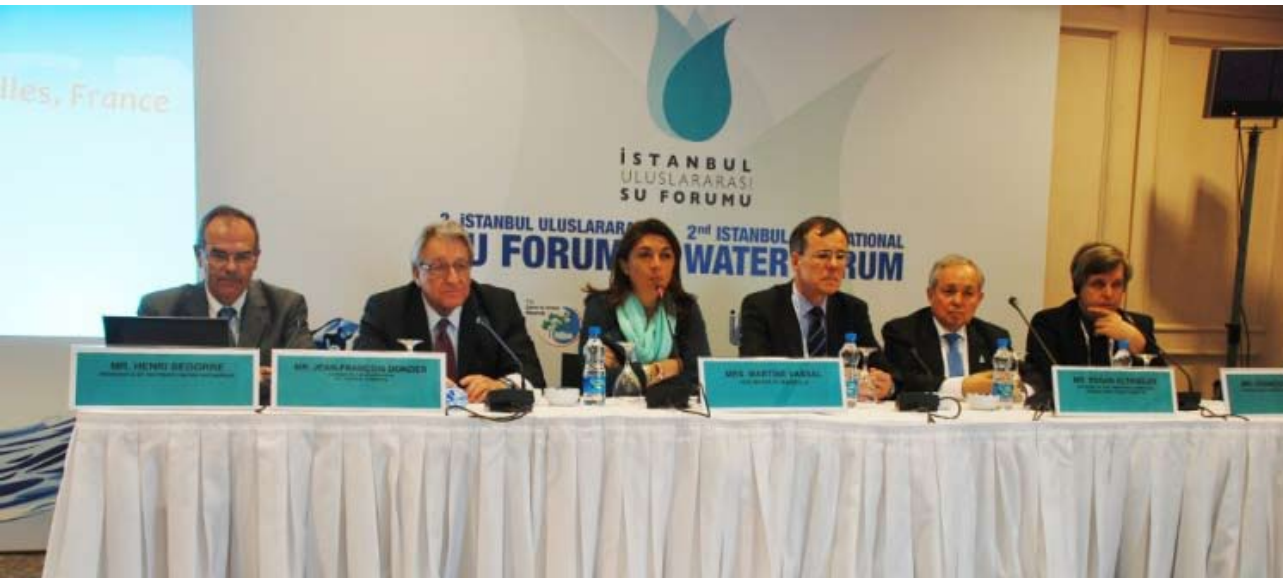
Members of the 6 th World Water Forum International Forum Committee

The preparation process of the 6 th World Water Forum, which will take place in Marseille between 12-17 March 2012 was explained in detail. The speakers consisted of members from various processes of the organizational team of the 6 th World Water Forum. Objectives and framework of the Forum and the action plans to reach concrete solutions were discussed. It was emphasized that the Forum will be realized with the cooperation of all stakeholders, including NGO's, governments, parliamentarians and ministers.