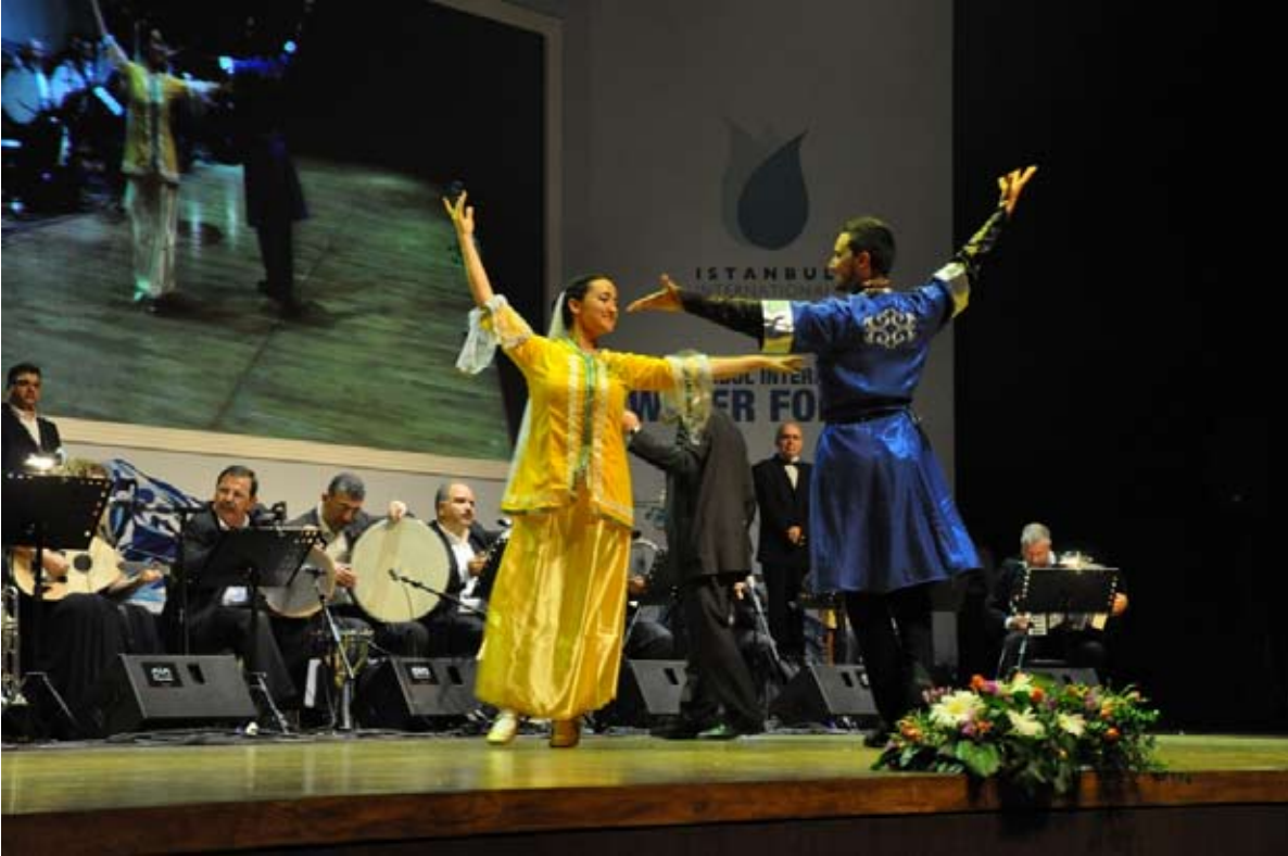
Istanbul Live Production

On the evening of the second day of the Forum, the Dostane group that is composed of state artists of the Ministry of Cultural Affairs staged a performance of traditional Turkish folk songs and dances.