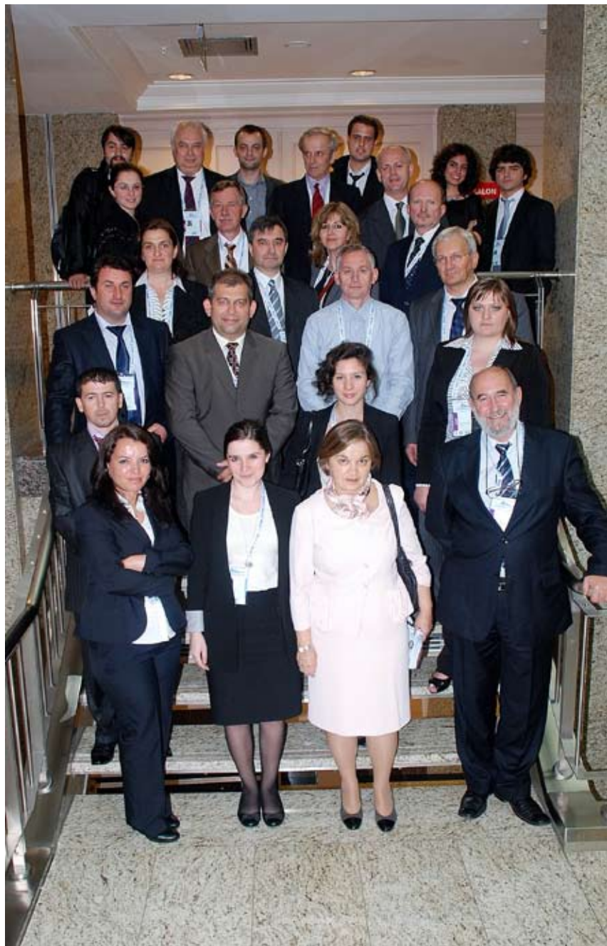
Participants of Eastern Europe Regional Focus Meeting

Implementation of proper IWRM systems including EU Water Framework Directive, creation of a single coordination and management authority within every country, encouragement of public participation in decision making process as well as bilateral and international cooperation were presented as possible solutions. It was also emphasized that economic analysis and standard measures should be revised in order to increase human and financial resources and supply more technical support.