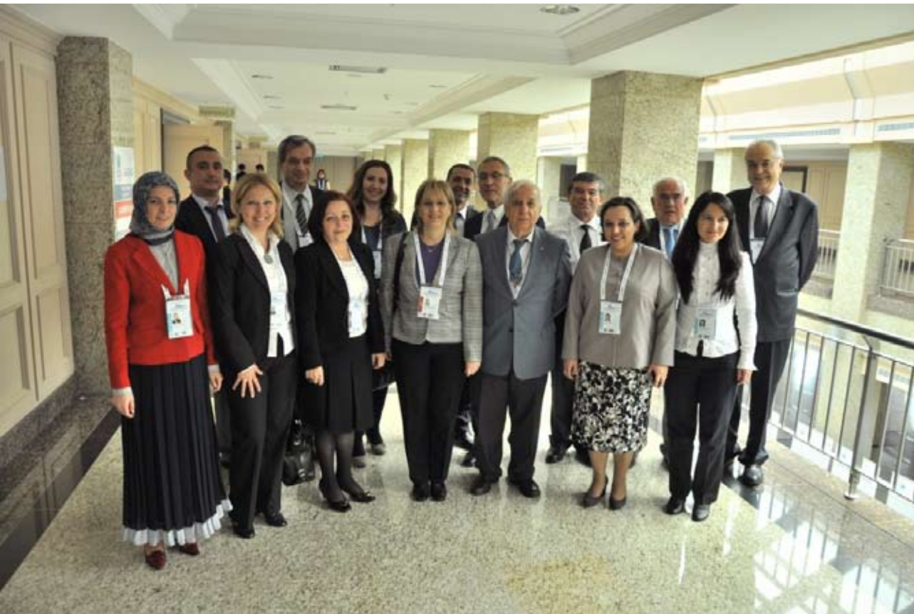
Participants of the Turkey Focus Meeting

Focusing on sustainable agricultural production and food safety and security, the meeting covered the necessity of modern irrigation systems, integrated basin management, green agriculture practices, training of farmers and effects of new regulations and policies on water users unions.