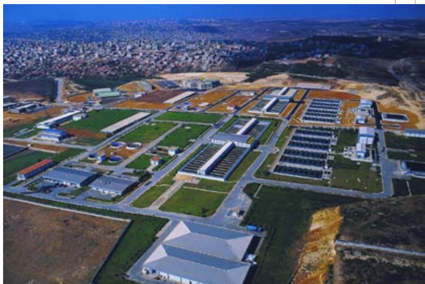
İkitelli Drinking Water Treatment Plant

refusal of 600,000 m 3 /day. The other was the İkitelli Drinking Water Treatment Plant with an average daily capacity of 420,000 m 3 of water.