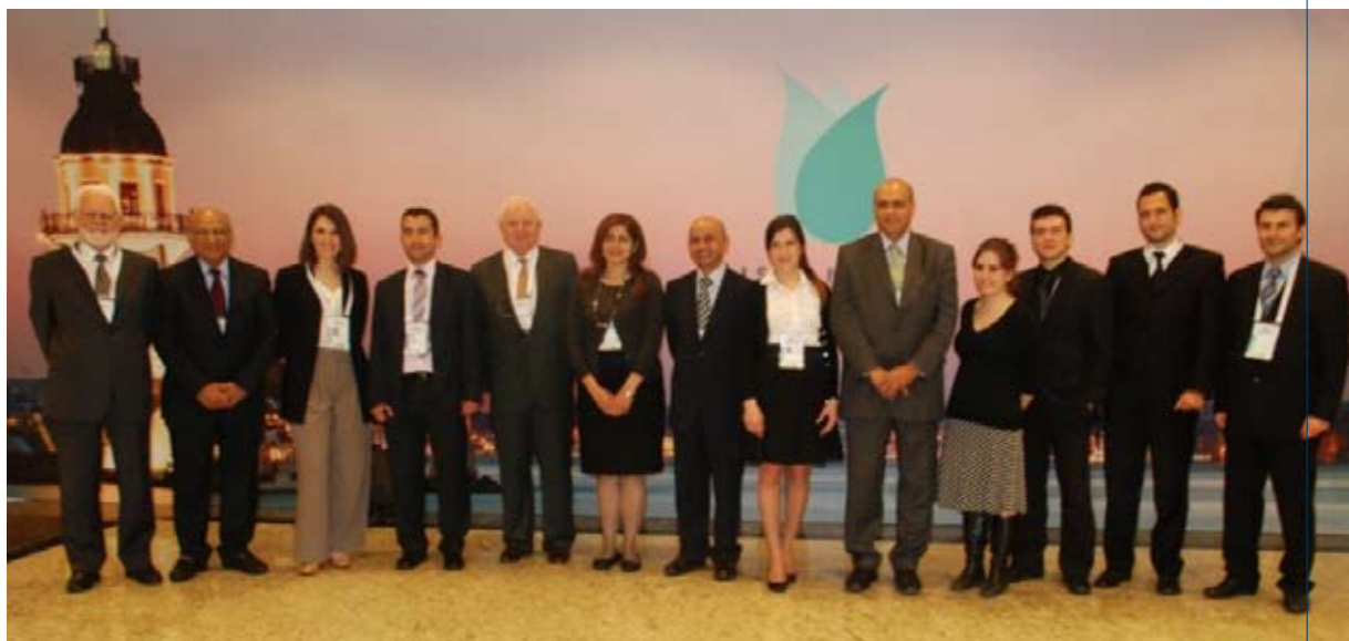
Participants of the Middle East Regional Focus Meeting

These fruitful meetings were followed by a second round that was held during the Forum to focus on the issues that were most highlighted in the first series of meetings. The RFMs held during the Forum gathered together international and regional water experts in closed roundtable meetings and provided a platform to address region-specific water challenges and solutions, with an aim to deliver them to the 6 th World Water Forum in Marseilles in 2012.