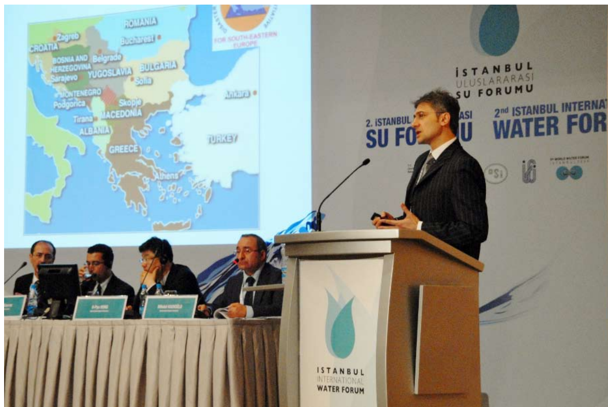
Session 4.1. Hydro-meteorological Disasters

This session discussed the driving forces and pressures on hydro-meteorological disasters. It was noted that the frequency of droughts and floods in various regions of the world are increasing in terms of frequency and magnitude. The phrase “think global, act local” was adopted as a key message expressing a general agreement. The importance of linking activities from regional to global level was emphasized to develop a multidisciplinary and multi-sectoral approach and multinational cooperation and participation at all levels. A project in Korea undertaken with the purposes of securing water, river-oriented community development, creating public spaces for residents, improving water quality and restoring ecology and flood risk mitigation was evaluated as an example of regional cooperation. Awareness raising in disaster management, education, transparency, participatory approaches in climate change mitigation and adaptation strategies were addressed. It was also noted that governments should focus on “regional know-how sharing” at global level for risk identification, assessment, monitoring and early warning systems.