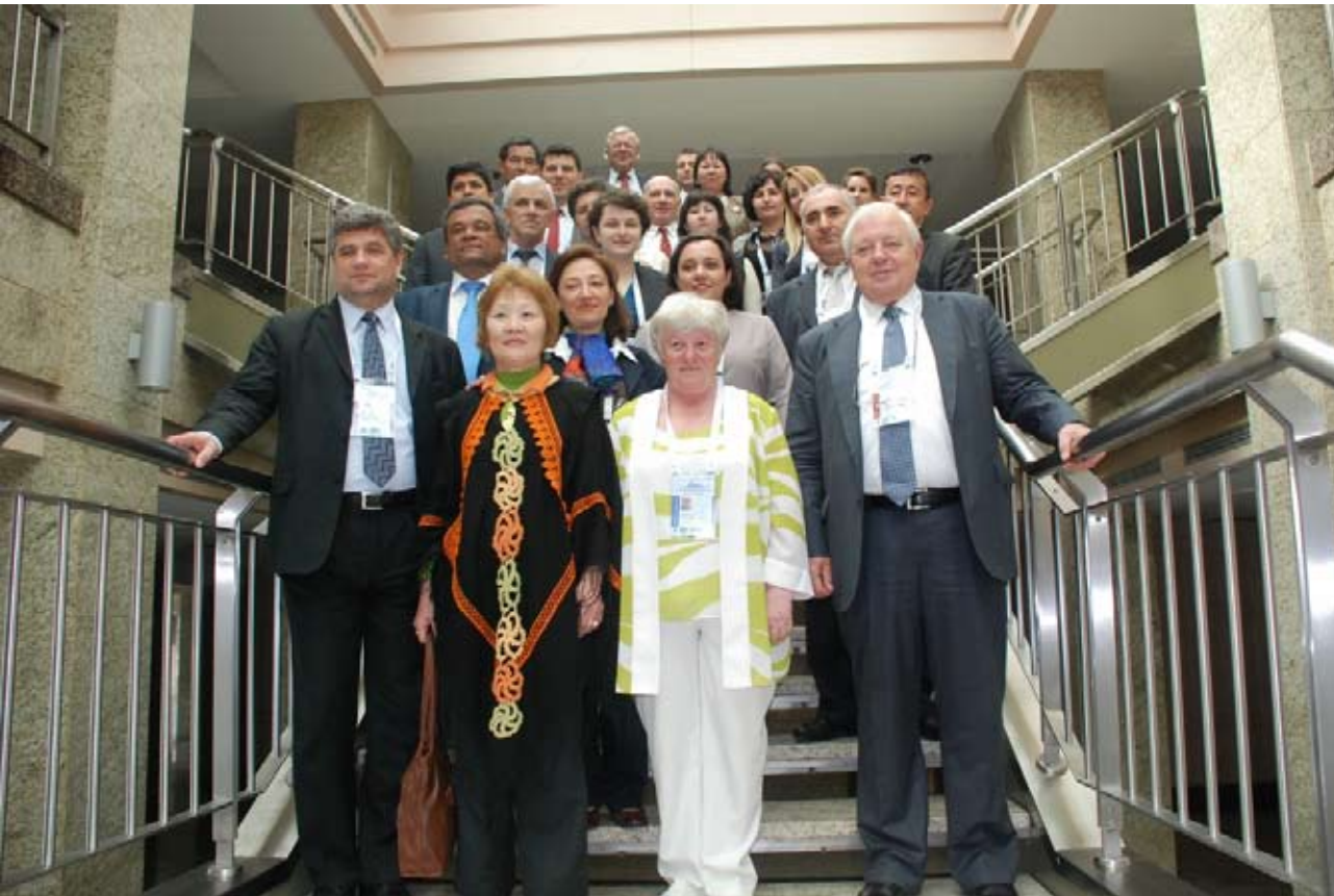
Participants of the Central Asia Regional Focus Meeting

The meeting concluded that water security is the key for regional food security. A more efficient allocation and integrated management of water resources based on regional cooperation and agrarian specialization, institutional and legal reforms, affordable technologies and finance are the top priorities for water security. Articles 46-50 on “Water and Food for Ending Poverty and Hunger” included in the Istanbul Water Guide, an important political output of 5 th World Water Forum, were accordingly addressed.