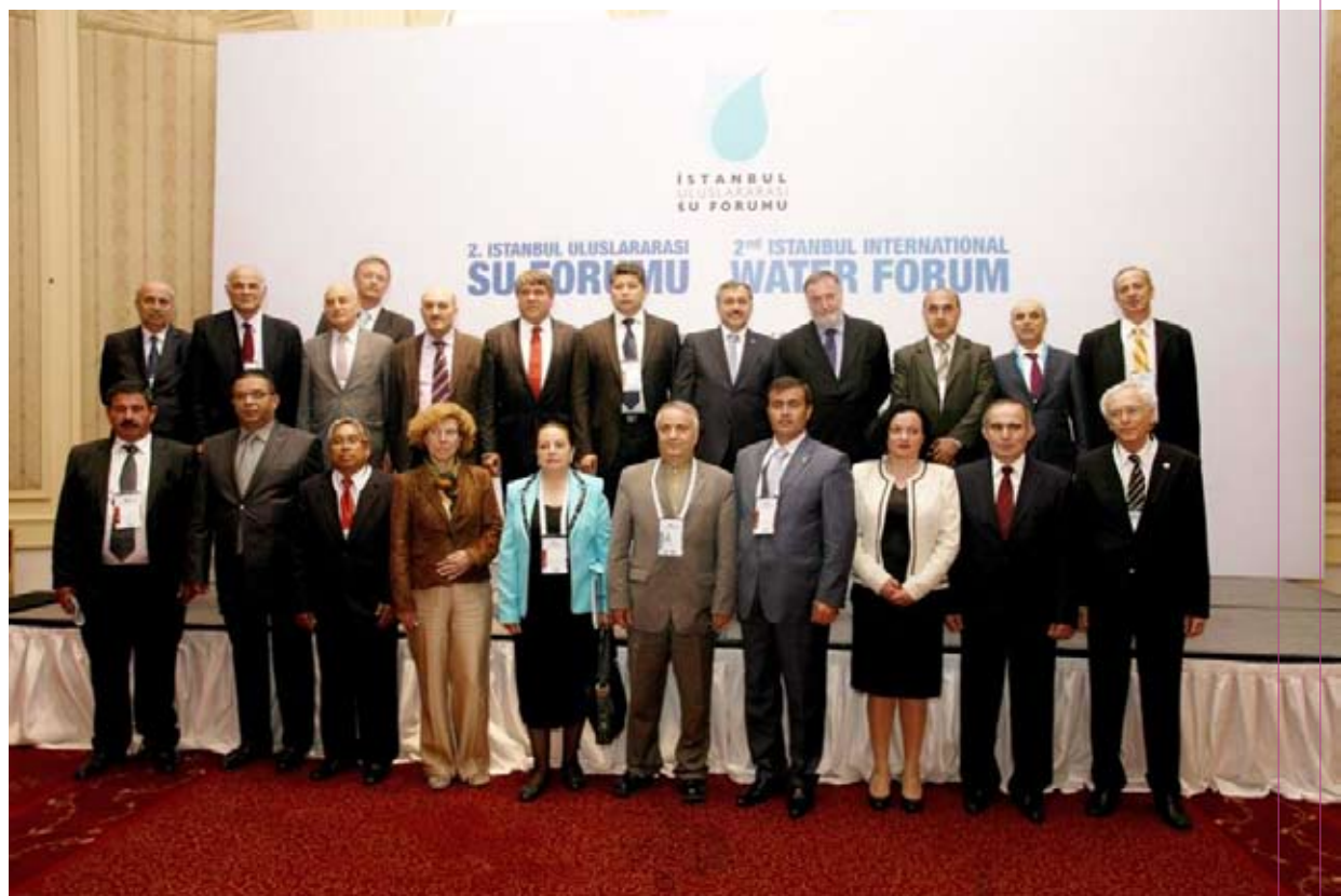
Participants of the Ministerial Meeting at Conrad Istanbul Hotel

On the first day of the Forum, ministers and high-level decision makers from countries of the Forum's focal regions met at the Conrad Istanbul Hotel to share their visions on common water challenges and explore areas of cooperation at the Ministerial Meeting organized by the Foreign Relations and EU Department of the Ministry of Environment and Forestry. During the meeting, ministers, representatives of international institutions and top-level water executives discussed the topics essential in overcoming global, regional and local water challenges.