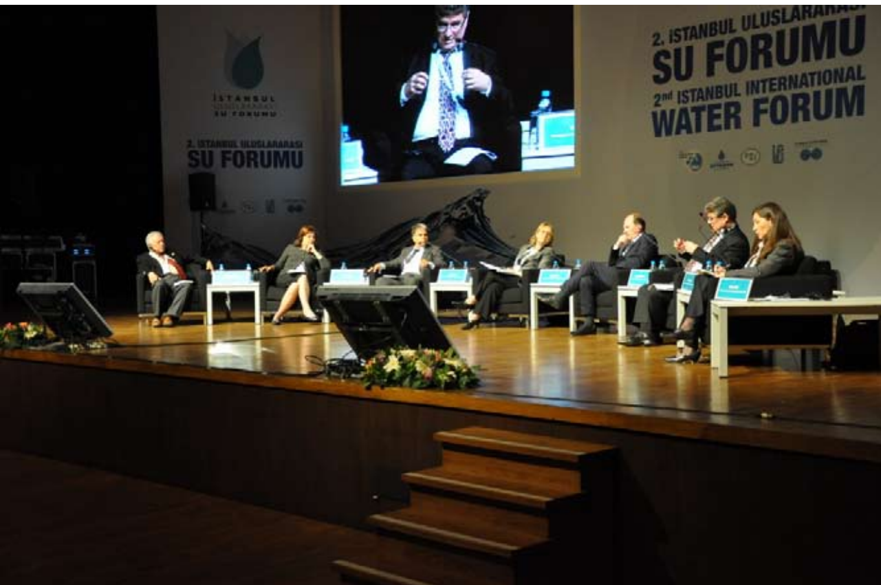
High Level Panel on IWRM Implementation within the Context of Regional Cooperation

The aim of this High Level Panel was to detect the available cooperation options required for handling the water-related problems of the Forum's focal regions. In order to meet the quantitative and qualitative standards of water, there is a need for implementing a well-functioning IWRM with the participation of multiple stakeholders. This session emphasized the need for mutual awareness among downstream and upstream riparians, information and technology sharing, and cooperation among state, private sector and the academia at micro level as tools for mitigating the complexities of politics and maintenance of peace. In other words, maintaining stable political conditions and improving technical cooperation were covered as mutually dependent variables. Besides implementation of an integrated water management plan, an inclusive system of good governance that can coordinate the roles of legislative, financial and political authorities was offered as a preferred choice.