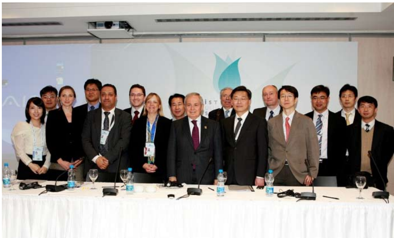
Organizers and panellists of the side event "Water as an Engine for Growth"

Green growth is about fostering economic growth and development, while ensuring that the quality and quantity of natural assets can continue to provide the environmental services on which our well-being relies. It is also about fostering investment, competition and innovation, which will underpin sustained growth and give rise to new economic opportunities. In this side event, case studies on water and green growth from Africa, Latin America and Asia were presented. Also, activities of East Asian Climate Partnership, contribution of hydropower and models that both encourage growth and investment in the natural capital to support local economies were discussed.