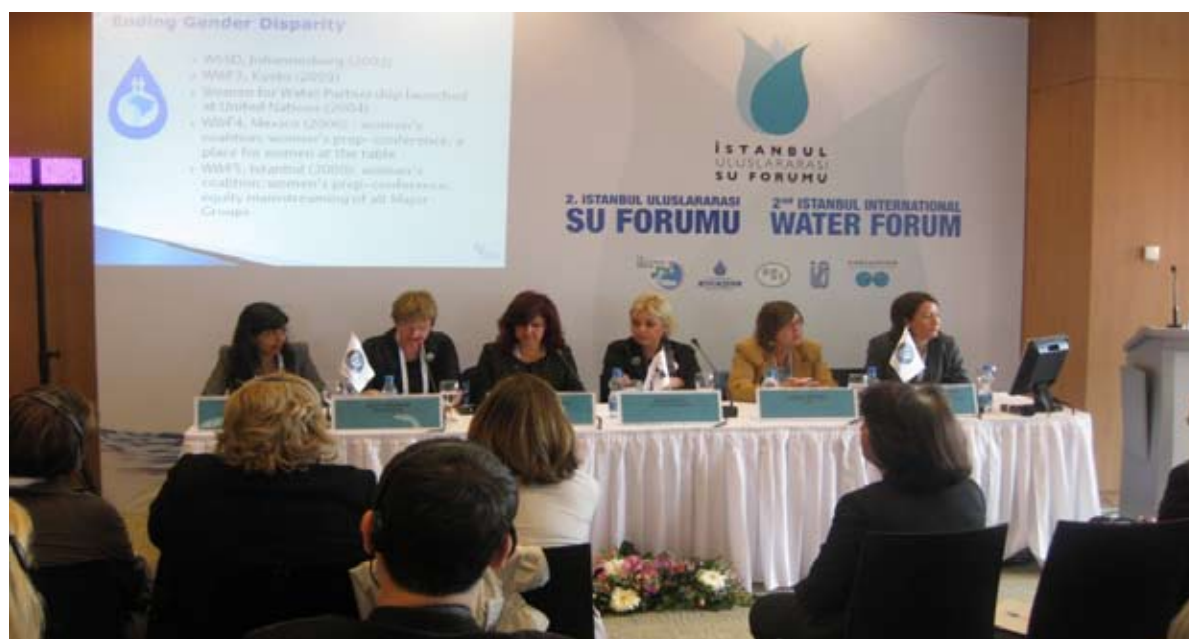
Panellists of the side event "Women and Water Policies"

Women are the most affected from water poverty. Although they play a central role in the supply, management and safeguarding of water, they are not equally involved in decision-making. In this side event, panellists pointed out the vital importance of women's inclusion and the accountability and transparency of the water management process. Institutionalization was underscored as essential in the facilitation of effective water management and equality in gender representation.