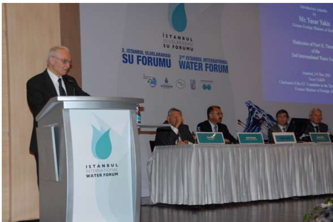
Yaşar YAKIŞ, Former Minister of Foreign Affairs of Turkey, giving an introductory speech in Session 1.2. Regional Technical Cooperation on Water II

More than hundreds of scientists, engineers, representatives of private and public sector and the civil society were congregated in the sessions to highlight new mechanisms, solutions and approaches to regional water problems. Highlights derived from each theme were further discussed in the wrap-up sessions and were then brought to the related High Level Panels.