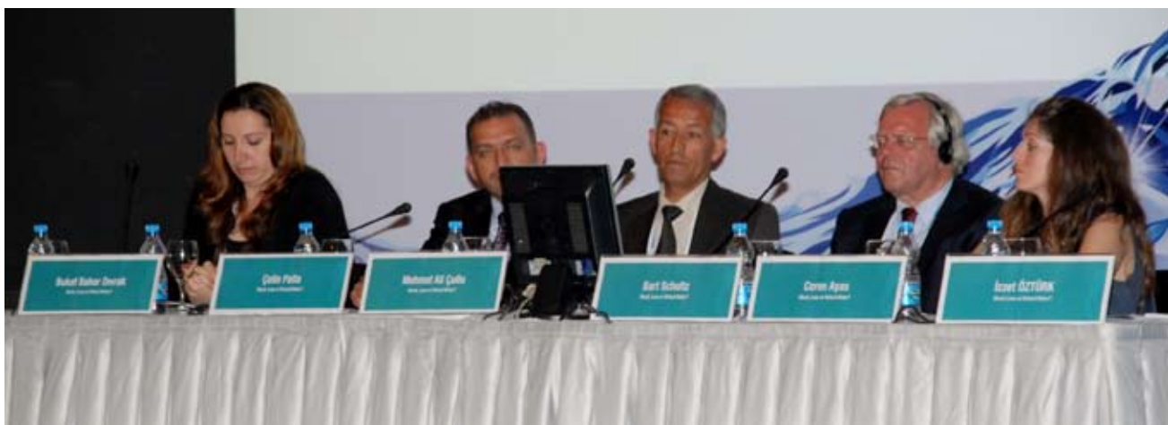
Panellists of Session 3.3. Much, Less or Virtual Water?

This session compared examples from various countries regarding agricultural production and efficiency in search for optimum water management practices for adequate food production. Measures to be taken towards effective and efficient use of agricultural water were discussed. Alternative solution suggestions were presented as models for Konya basin in terms of mismanagement of water resources that leads to agricultural drought in food production. Water reuse in agriculture, the importance of wastewater treatment, features of treatment plants were discussed. The concepts of water footprint and virtual water were highlighted with regard to water resources planning.