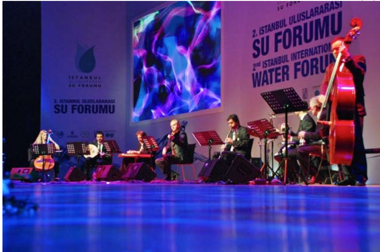
Performers of the Varol Cultural Centre at the Opening Ceremony

The Opening Ceremony of the Forum started with the instrumental performance of the Varol Cultural Centre founded by the Turkish Classical Music Choir state artist and composer Necdet VAROL. The repertoire consisted of instrumental semais , overtures and longas .