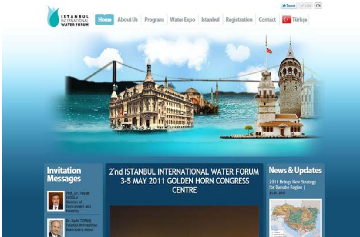
A snapshot of the Forum website

was also the main platform for online registration and submission of contributions to the Forum’s thematic sessions. The Forum website had 27,089 visits in total with an average of 5,36 pages/visit and 145,068 pageviews between January and August 2011.