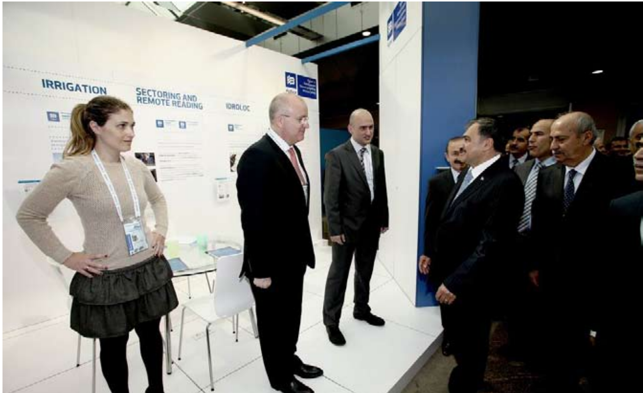
Minister Veyisel EROGLU visiting the stands at the Water Expo