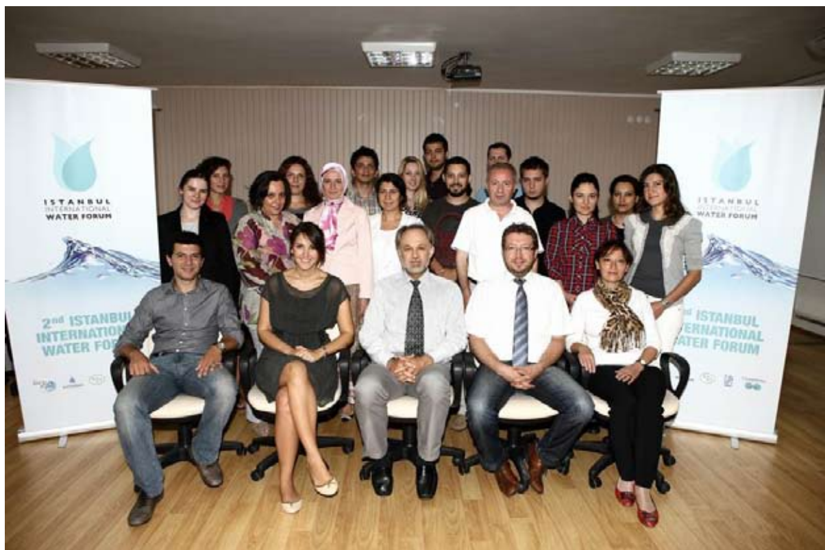
The Forum Secretariat

Last but not least, we would like to thank all Forum participants who contributed towards making the 2 nd Istanbul International Water Forum a success.