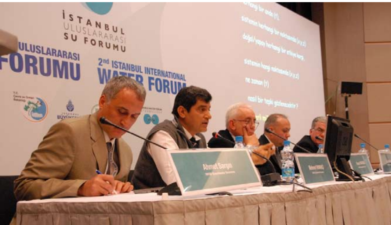
Panellists of Session 6.2. IWRM - Groundwater Resources